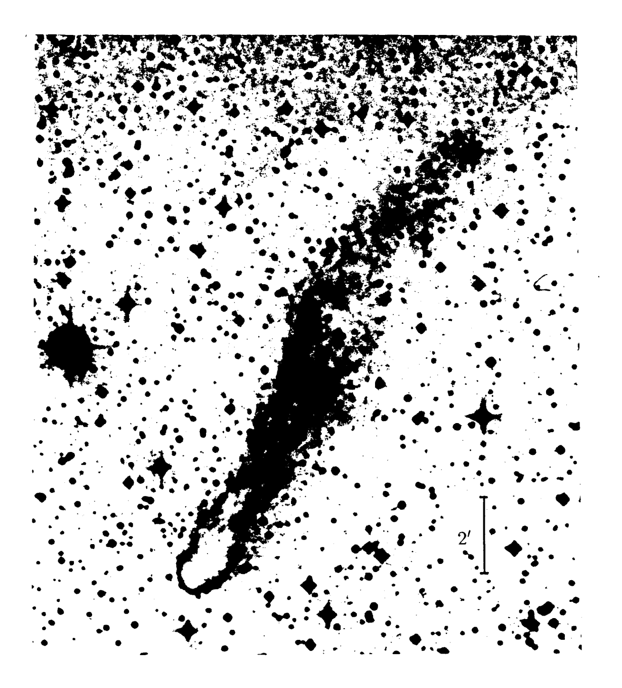
Figure 1.1: An optical image of CG 15, a typical cometary globule reproduced from the SERC survey plate (what is shown is a negative image). The obscuring head is seen as a white patch whereas the tail and the bright rim are black.