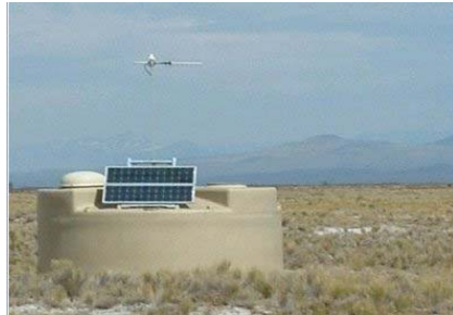
Figure 4. A water tank detector in the Pierre Auger observatory in Argentina.