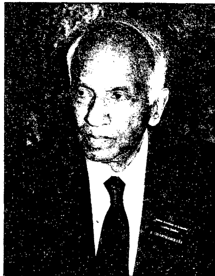
At the Golden Jubilee meeting of the Indian Academy of Sciences.

existence of the limit, and went on to speculate, presciently about stars with the density of atomic nuclei, and incorrectly about new physics – energy nonconservation – coming into play. Chandrasekhar's work was distinguished both by mathematical thoroughness and a conviction that the result was of fundamental importance. Strong conviction was badly needed, because Arthur Eddington, the Plumian Professor of Astronomy at the University of Cambridge, ridiculed the final result as an absurdity, claiming that one of the starting assumptions was in error. Since Eddington could not pinpoint the error in a manner acceptable to physi-